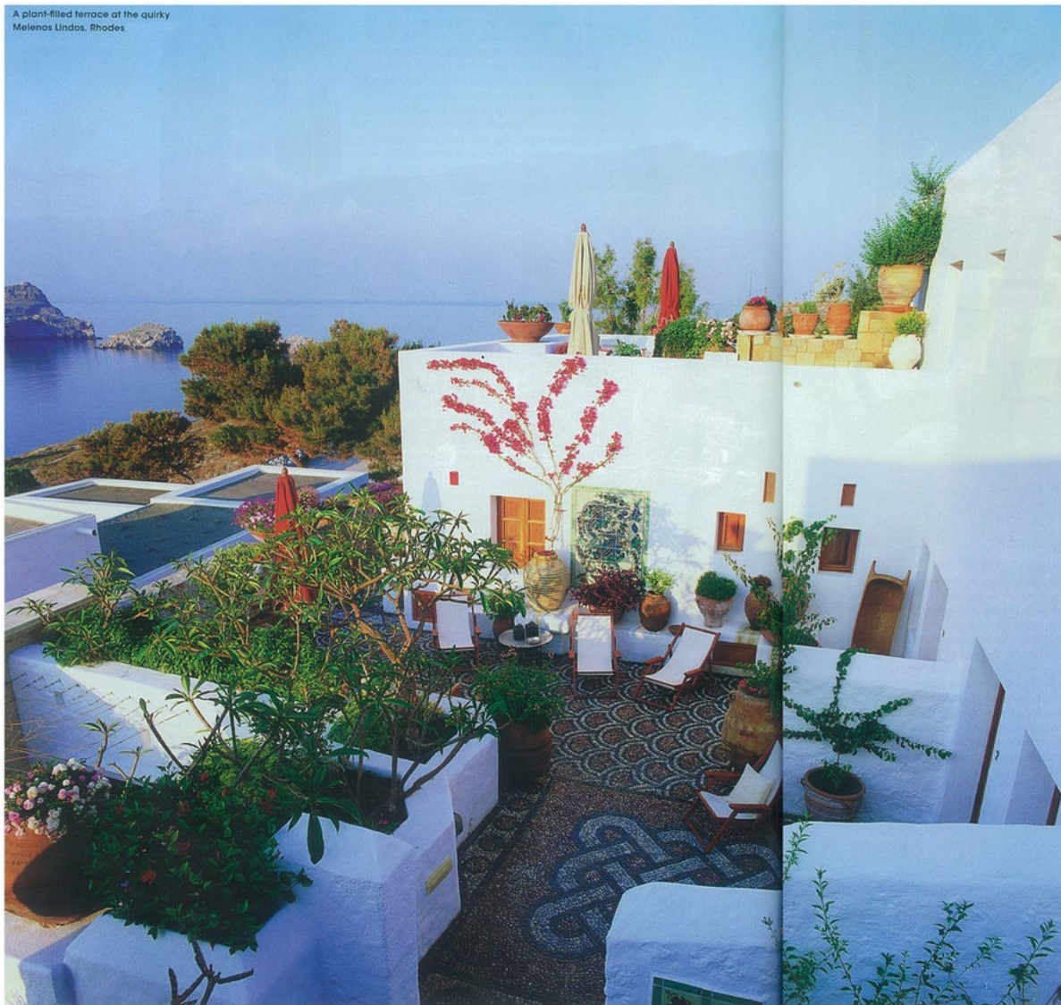
A plant-filled terrace at the quirky Melenos Lindos, Rhodes