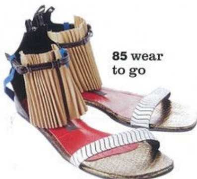
85 wear to go